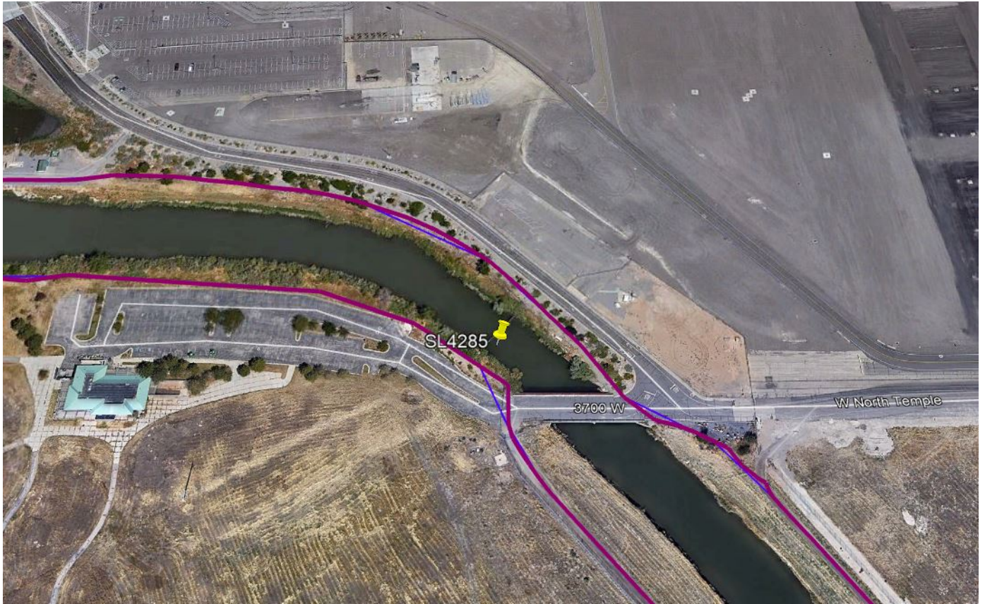
2) Location map